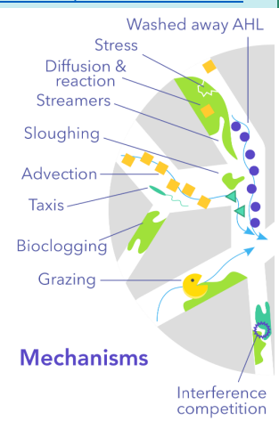
Figure 1: Example mechanisms linked to bacterial growth in porous media. AHL is one of the autoinducers for communications.

Scientific project. We are studying couplings between fluid flow and mechanisms controlling the development of microorganisms in porous media (figure 1). More specifically, this project aims at exploring how communications between bacteria, in particular quorum-sensing (QS), are influenced by flow in porous media. Bacteria communicate via signalling molecules, called autoinducers,